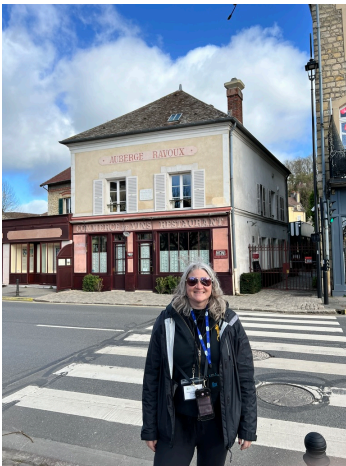
The house Van Gogh lived in Auvers-sur-Oise, France

We hope you find this newsletter helpful and share it with your friends and family. We welcome ideas and feedback as we continue to strive to build the business. Our goal is to email the newsletter quarterly. Please let us know if you would no longer like to receive the newsletter.