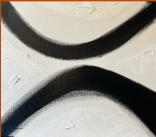
Possibilities, 16x20", oil on canvas

As a newsletter subscriber you are getting first view of my work for Art-A-Whirl! This is your chance to purchase the works shown in this newsletter before going on view. Contact me now to preorder your favorite painting.