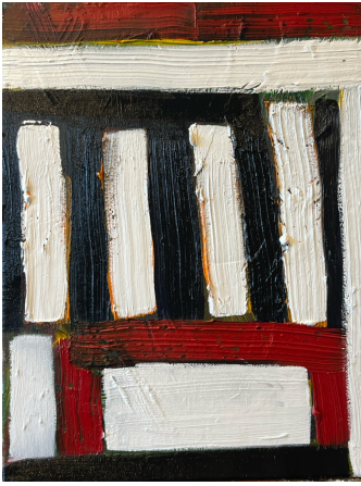
Believe, 14x11", oil on canvas