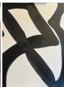
Acceptance, 20x16", oil on canvas