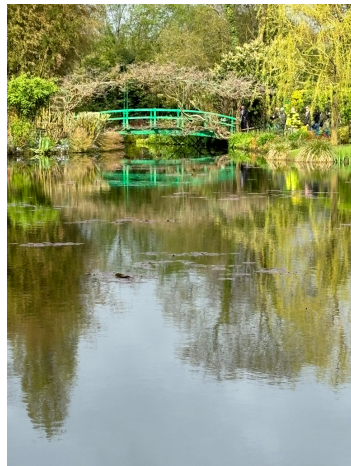
Monet's garden in Giverny, France