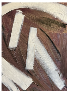
Journey, 14x11", oil on canvas

Along with the three paintings to the left, these paintings will also be on display at Art-A-Whirl May 17-19. These are the beginning of my new series.