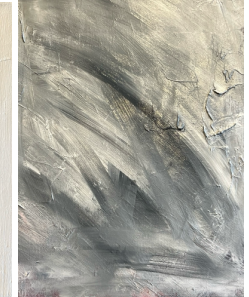
Hold Space, 14x11", oil on canvas