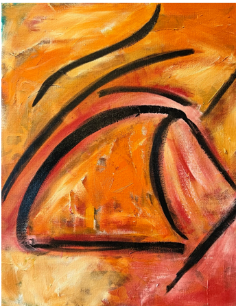
Hope, 20x16", oil on canvas