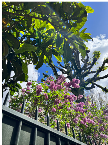
The lilacs in Renoir's garden in Montmartre, Paris, France